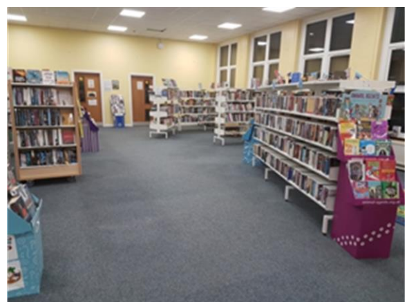
Silverdale library following the stock reorganisation