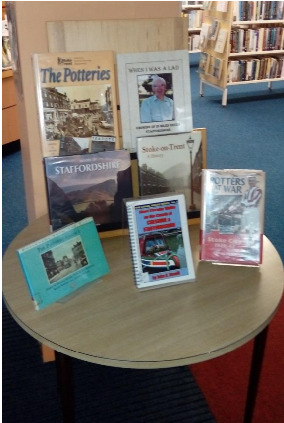
Promotion of local stock at Audley Library