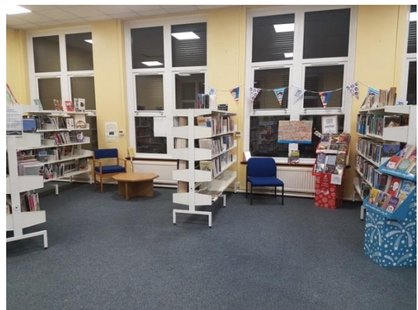
Silverdale library following the stock reorganisation. As well as providing more space for events in the library the stock was rearranged to make it more easily accessible and create space to enable more face on display.

Customer comment following the reorganisation "It's lovely in here, nice and bright and lots of space"