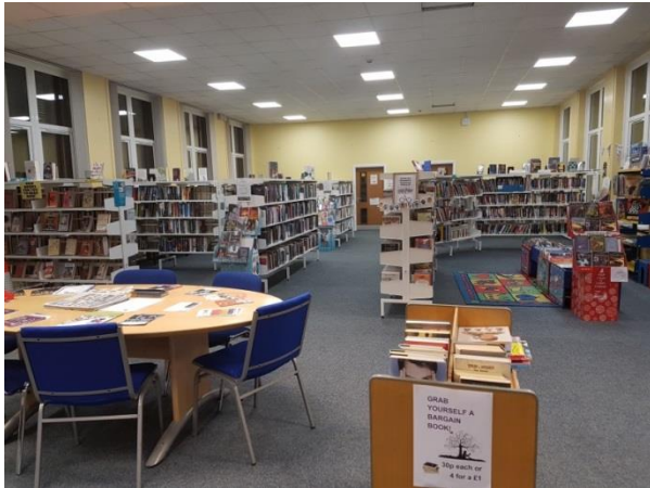
Silverdale Library before the stock/ layout reorganisation inspired by the modules in the toolkit.