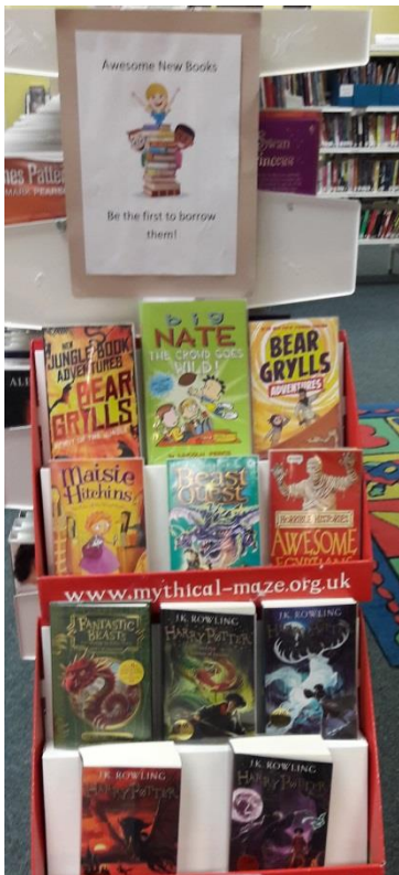
Promotion of new stock at Silverdale Library