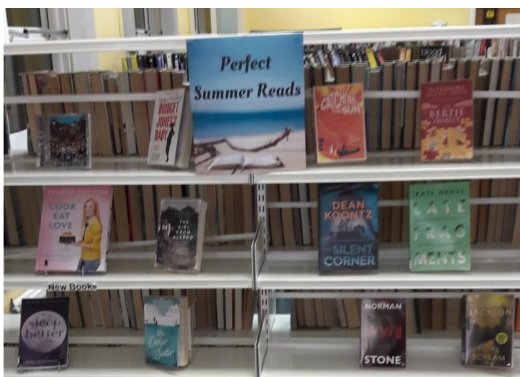
Summer reads promotion at Silverdale Library

This is being changed once a fortnight on a theme tied into national events. They have noticed people browsing more than usual in this area.