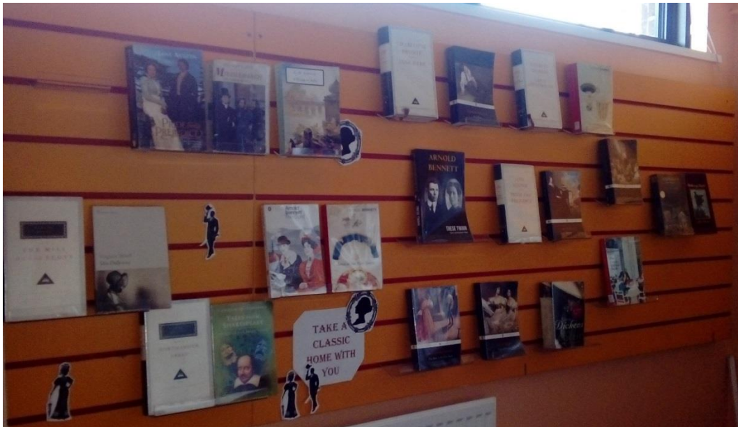
Classics promotion at Audley Library