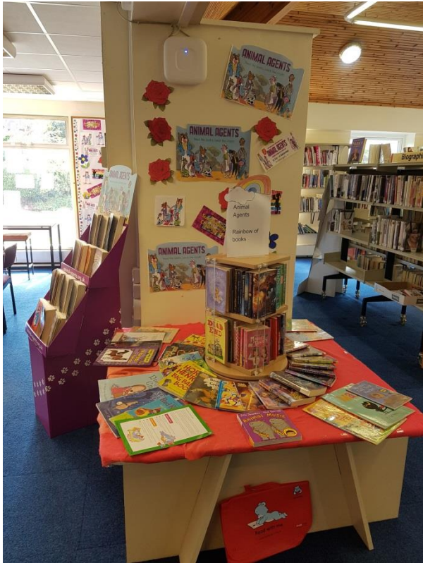
Brewood Library Rainbow of children's books