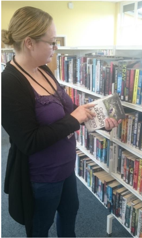
Silverdale volunteer working on stock maintenance

Promotions – making the most of your books