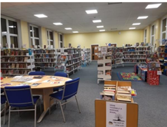
Silverdale Library before the stock/ layout reorganisation inspired by the modules in the toolkit.

Silverdale rearranged their library after completing the training. To provide more space for events in the library the stock was rearranged to make it more easily accessible and create space to enable more face on display. Following the reorganisation a customer commented, "It's lovely in here, nice and bright and lots of space" .